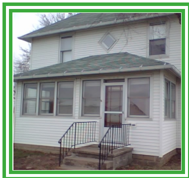
St. John Evangelical Lutheran Church in Deshler has donated their old parsonage for HFH to salvage doors, windows, and other fixtures from. We're looking for volunteers to help in the deconstruction!